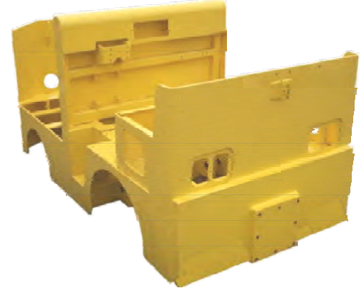
One Piece Welded Frame