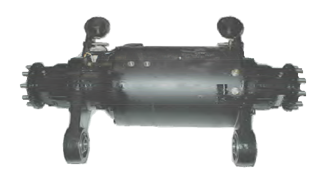
Heavy duty drive axle (The drive motor is coaxial with drive axle) with internal wet disc brake.