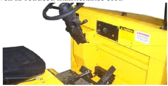
Showing Operators Compartment with Standard Tilt/Telescoping Steering Column.

The Danaher Inverter is standard equipment on the Model 700AC series. The Danaher Inverter combines the reliability of high efficiency power MOSSFET control with the added flexibility of microprocessor technology to provide smooth durable and customized control. The Danaher motor inverter offers many safety and performance features resulting in direct cost savings benefits to your operation. Smart full time diagnostics, battery condition monitoring, and completely cold contactor switching are just some of features that ensure a safe truck as well as reduced maintenance cost.