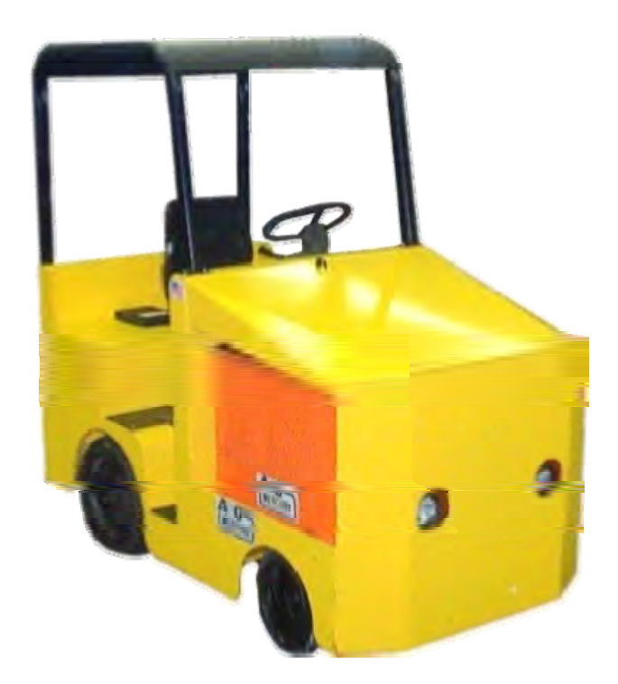
Note: Shown with Optional Over Head Guard, & Grammer Seat.