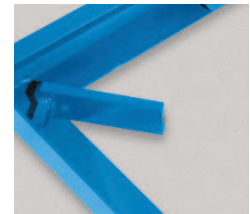
▶ MSL Swing Arm Safety Bar