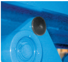
▶ Platform Centering Device