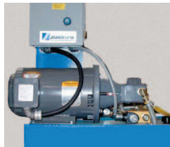
▶ Power Unit w/Controller