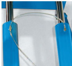
▶ MSL Cylinder w/Clear Plastic Return Lines