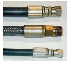
▶ Double Wire Braid Hose