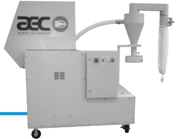
GP1200 Premier Series Granulator (shown with optional evacuation)