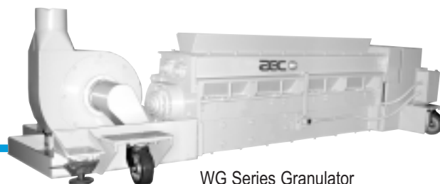
WG Series Granulator

Designed for continuous reclamation of skeletal web directly from the thermoform trim process, the WG Series granulators are available with 36" or 56" infeed widths. For low-power, low-rpm operation, six knives are mounted in an offset pattern on the alloy steel rotor in conjunction with two adjustable, stationary knives with double cutting edges. This means more lineal inches of cut, more capacity, and less likelihood of plugging.