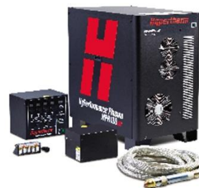
Hypertherm HPR130XD With Auto Gas Standard