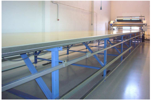
Air blowing table

SMOOTH, AIR BLOWING and CONVEYOR TABLES: Strong strucure of Iron legs, treated with anti-rust paint, side rails for movement of the machina, top wood panels with perfect junctions and smooth surface. Side rails for the opearator platform and electrical installation for the machine