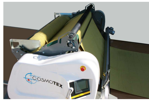
Cradle feed with single piece CONVEYOR BELT.