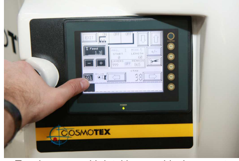
Touch screen with intuitive graphical parameters