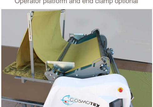
Book folded fabric