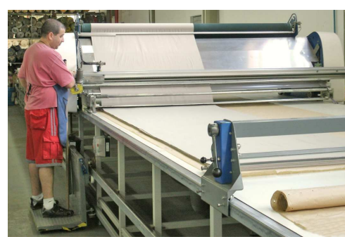
Operator platform and end clamp optional