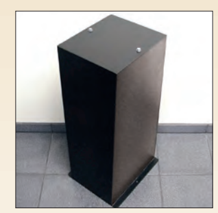
Machine stand Part No. 30120 Sturdy steel machine stand with black powder coating.