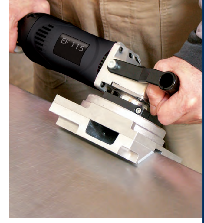
The handy ROLEI® EF 115 can deburr and facet large, heavy parts with ease. The precise edge control guarantees clean bevels at an angle of 45°.

This handy deburring machine is designed for awkward, heavy parts, such as machine tables, frame constructions or large sheets of metal. Easy to handle, with good edge control. The EF 115 is also ideal for chamfering welds. Fixed beveling angle of 45°, infinitely adjustable facet width from 0" to 3/8".