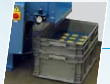
Convenient new chip removal system with easy handle-n-dump totes.