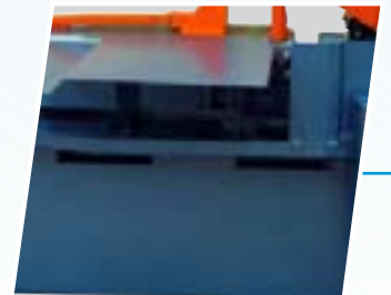
Forklift pockets added for easier transport. Shown with optional larger discharge tray and base for coolant containment.