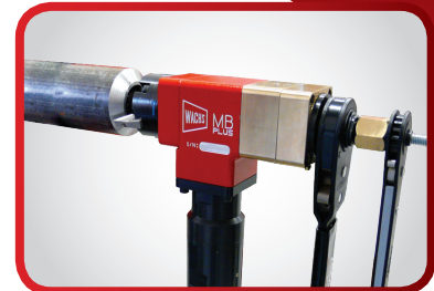
MB Plus quickly makes precision bevels on even the toughest pipe materials.

*With Extended Range Kit. Kit included with 1.0 HP pneumatic model 71-000-05