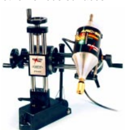
360 kg (800 lb)-pull permanent magnet with 7 precision angle/ position adjustments