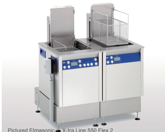
Pictured Elmasonic X-tra Line 550 Flex 2

Modular cleaning line consisting of ultrasonic cleaning unit plus rinsing unit, available in 5 different unit sizes (300, 550, 800, 1200 and 1600). There are two different models for each size: multi-frequency 25/45 kHz (MF2) or 35/130 kHz (MF3). Available rinsing tank models (S): with heating (H) or without heating. The oscillation device for the cleaning basket assists and improves the cleaning and rinsing effect and also provides a drip-off support for the stainless-steel basket (EKO). The cleaning line can be fitted with a hot air dryer (WLT) of the relevant size. The units are delivered including support frame.