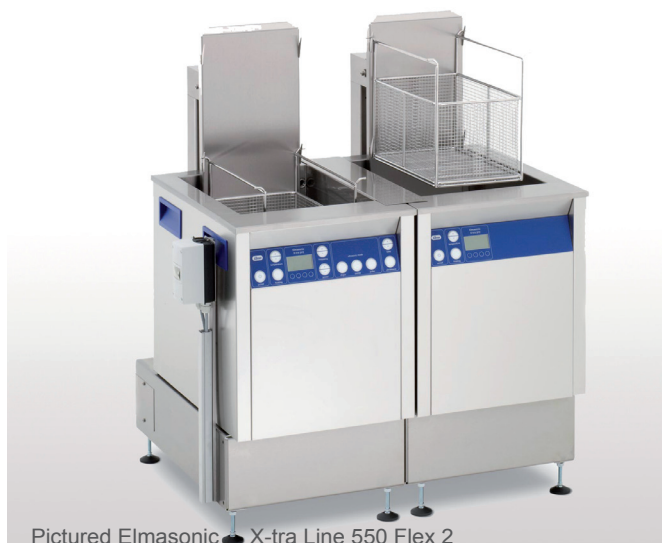
Pictured Elmasonic X-tra Line 550 Flex 2

Modular cleaning line consisting of ultrasonic cleaning unit plus rinsing unit, available in 5 different unit sizes (300, 550, 800, 1200 and 1600). There are two different models for each size: multi-frequency 25/45 kHz (MF2) or 35/130 kHz (MF3). Available rinsing tank models (S): with heating (H) or without heating. The oscillation device for the cleaning basket assists and improves the cleaning and rinsing effect and also provides a drip-off support for the stainless-steel basket (EKO). The cleaning line can be fitted with a hot air dryer (WLT) of the relevant size. The units are delivered including support frame.