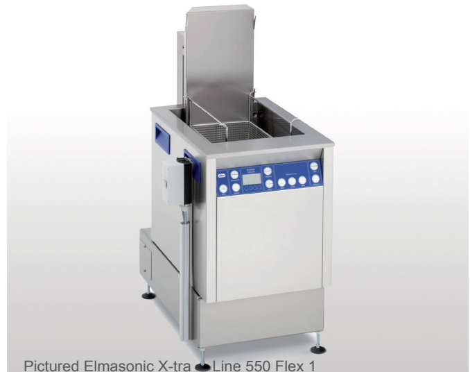
Pictured Elmasonic X-tra Line 550 Flex 1

Ultrasonic single workstation for the industrial cleaning, available in 5 different unit sizes (300, 550, 800, 1200 and 1600) and two different models each: multi-frequency 25 / 45 kHz (MF2) or 35 / 130 kHz (MF3). The unit is equipped with an oscillation device for the cleaning basket which assists and improves the cleaning effect of the ultrasound, and which also provides a drip-off support for the stainless-steel basket. The units of the Elmasonic X-tra pro series can be combined with a rinsing tank (with / without heating) and a hot air dryer of the relevant size. The units are delivered including support frame.