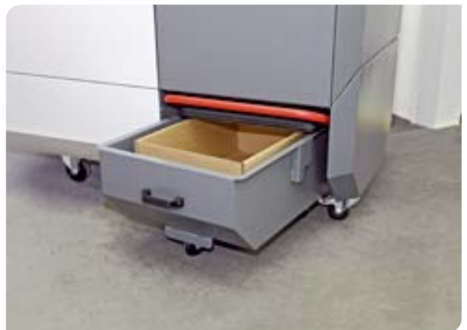
The mobile 90 litre dust collection drawer can also be transported using a lift truck or fork lift.