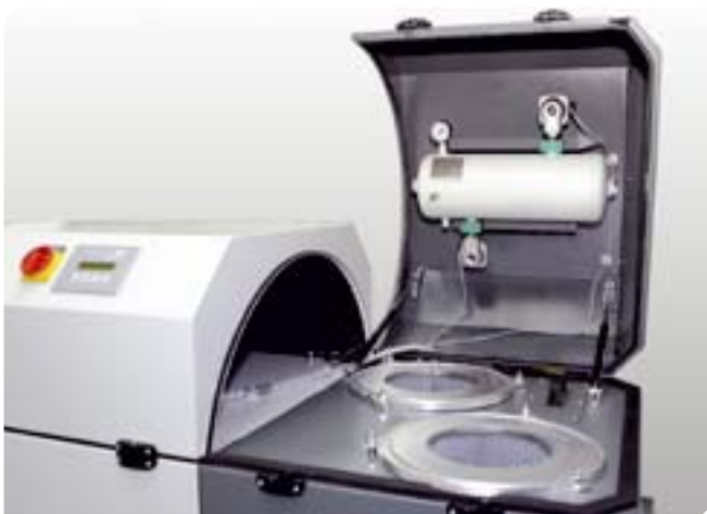
The top of the filter module is hinged so as to provide convenient access for service and maintenance work.