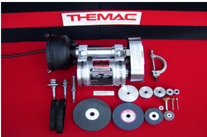
300-TTPG THEMAC Tool Post Grinder ID AND OD WHEEL CAPACITY OF 6", INCLUDES SPINDLE EXTENTIONS FOR INTERNAL GRINDING