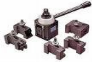
300-QCT-20 Wedge-style Quick-change toolpost & 5-toolholders

CELEBRATING 26 YEARS IN BUSINESS – 1985 TO 2011