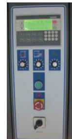
PLC Control Board