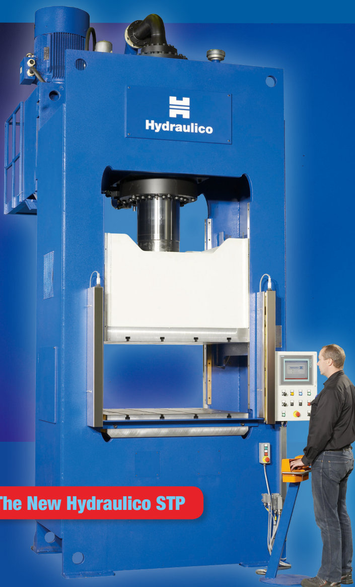
The New Hydraulic STP