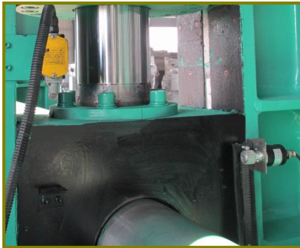
C Upper roller position controller