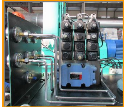
D Hydraulic system