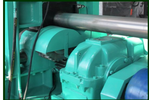
B Drive device of bottom rollers