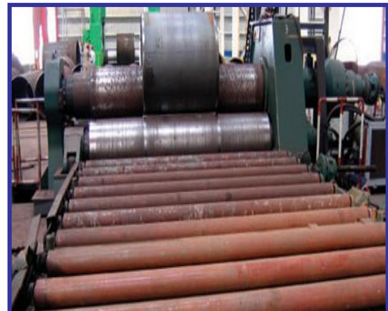
Material supply equipments