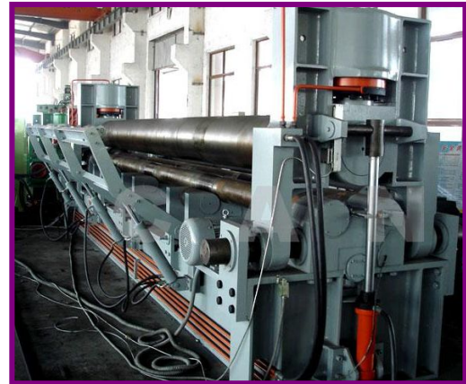
Hydraulic Material plate support