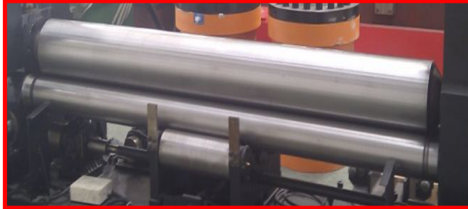
A. Lifting device of up roller