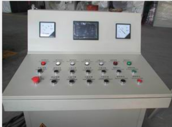
➔ Control panel