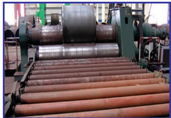
Material supply equipments