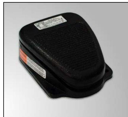
The Model 376 features a footswitch trigger. Optional palm triggers can be used for hands-free operation.