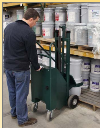
Picking from Pallets and Racks