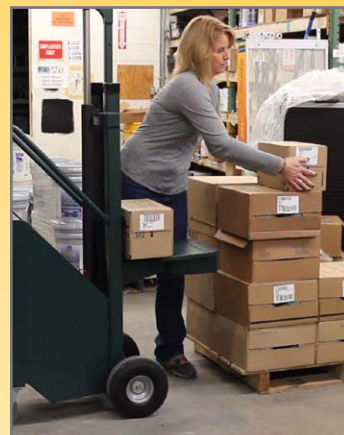
Yoke Cover for Handling Case Goods