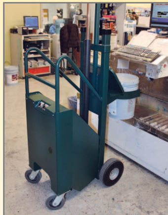
Loading Paint Tinters