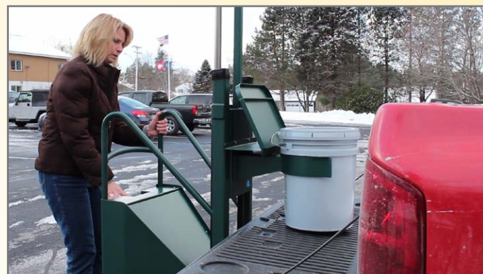
Delivering to and Loading Customer Vehicles

Works in the same operating space as a two-wheel truck.