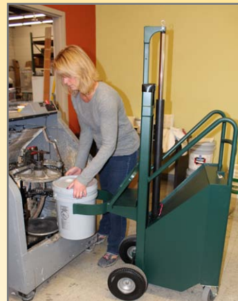
Loading Paint Shakers