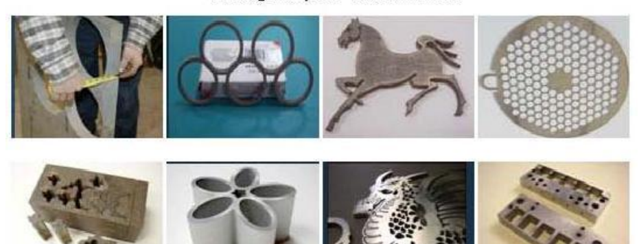
Cutting samples-Steel plate