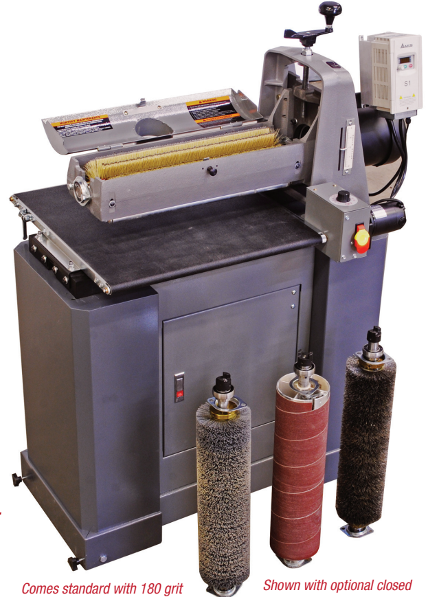
Comes standard with 180 grit flatter head.

These are just a few of the applications that are possible with the 19-38 Combo.