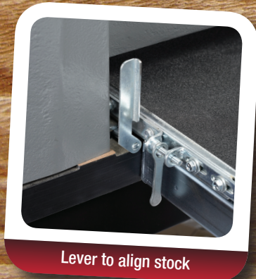
Lever to align stock