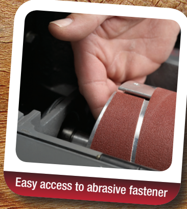
Easy access to abrasive fastener