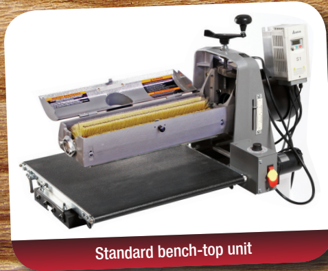
Standard bench-top unit