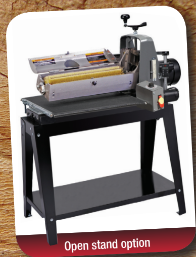
Open stand option