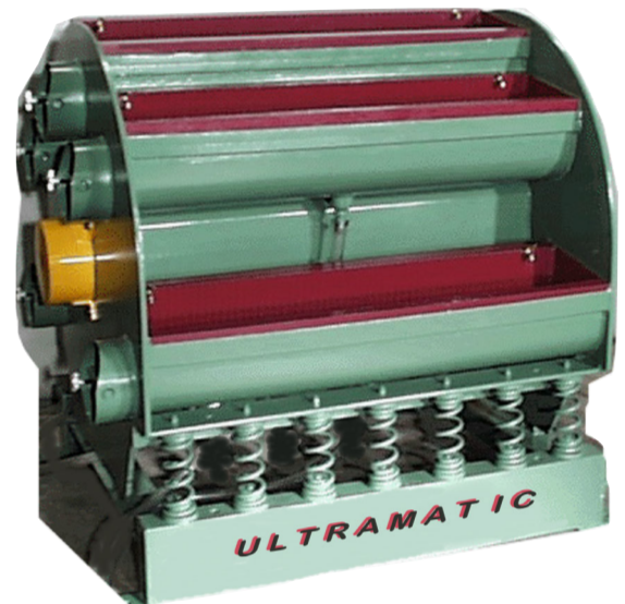
Model MT-5 Five Tub Design

The New MT SERIES (patent# 5803233) by UltraMatic is the most unique innovation in the vibratory finishing industry. The MT features up to five tubs ON ONE DRIVE enabling the user to run multiple processes e.g ; (deburr, wash, burnish, descale, and dry) all simultaneously!! The MT will run any media including heavy steel media yet is flexible enough to run 96" long aluminum aircraft parts with critical tolerances. The requirement to purchase several machines to keep different part types separated is gone. Now you can purchase one MT machine with five tubs for the price of one and minimize the moving parts (motors, belts, bearings, etc.) that are required with multiple machines. Increase productivity by adding our MT series to your finishing department.