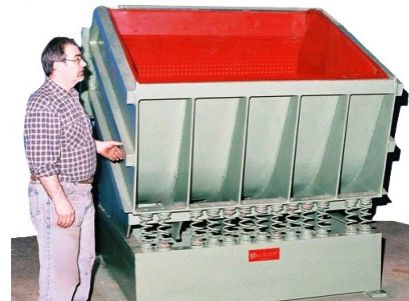
MODEL OHD 4860 FEATURES CURVED REAR WALL LOW FRONT STANDARD

UltraMATIC EQUIPMENT CO. 848 S. Westgate Drive Addison, IL. 60101