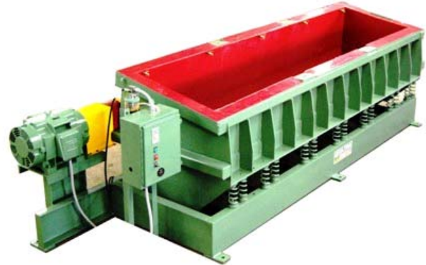
MODEL OHD 36144

The Ultramatic OHD Large Tub Series are batch tub machines ranging in size up to 400 cubic feet processing capacity. Our Patented Overhead Drive System provides unparalleled vibratory energy. The result is any size part made can be processed in our OHD machines. (See OHD9696 article)