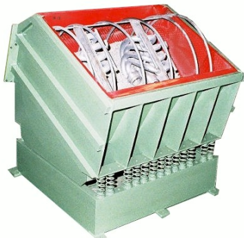
OHD 4860 RUNNING A FIXTURED PART TUB SIZE 4 FOOT X 5 FOOT WIDE

MODEL OHD 4860 (4 ft. deep x 5 ft. long tub) 50 cubic foot batch tub deburring a heavy 1000 lb. fully machined, cast iron vacuum pump housing in ceramic media. The photo at the right is a closeup showing overhead hoist removing part from the media. No fixtures are required to process parts due to the patented O.H.D drive exclusively by Ultramatic . Longer tub lengths are available to process additional parts simultaneously.