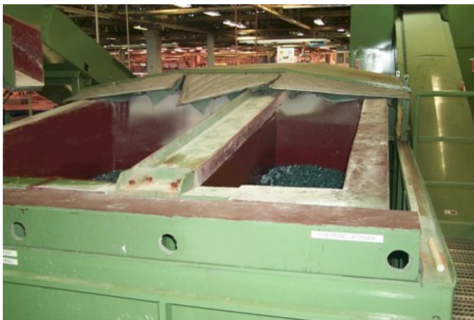
Photo to the left shows the OHD 9696 Tub with Removable Divider having the Media unloaded using the Automated Material Handling System. It consists of a Vibratory Screener for media sizing, Conveyor for transfer to a Storage Hopper, and a Return Conveyor back to the Vibratory Machine.

MODEL OHD 48144 has a tub dimension of 4 ft. deep x 12 ft. long and a process capacity of 140 cubic feet. The part is 8 ft. in length x 3 ft. wide fully machined titanium aircraft bulkhead. .008 radius in 90 minutes replaced the previous method of 60 hours of hand deburring. This machine holds 12,000 lbs. of ceramic media.