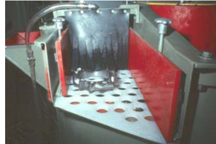
Optional Screen Deck Spray Rinse