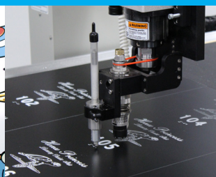
ADA Braille Sign