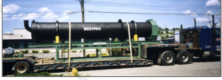
Modular Rotary Drver

P.O. Box 726 Vernon. BC Canada V1T 6N6 Tel: (250) 549-6710 Fax: (250) 549-6735 Toll Free: 1-877-WESTPRO (937-8776) Email: sales@westpromachinery.com