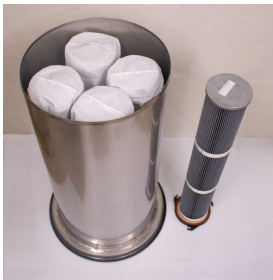
Filtration bottom view