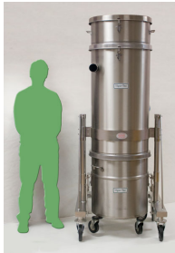
Main tower next to an average sized man