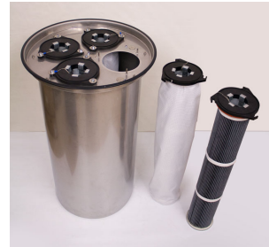
Filtration top view