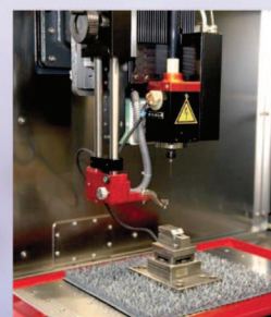
PG-S-M manual height adjustable guide holder

The integrated retractable device leaves the quick access for the operator of the working area and the work piece under the guide holder.