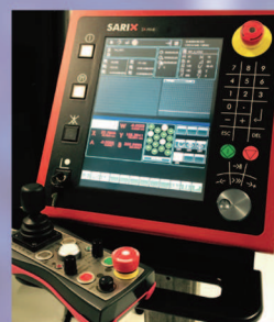
SX-HMI 12" Touchscreen control unit with joystick comand handbox

Maintenance control and machine status are displayed on several part windows Log-file and part program machining log are on direct access by Ethernet or USB port.