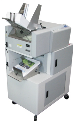
Switch from duplex to simplex printing in seconds!