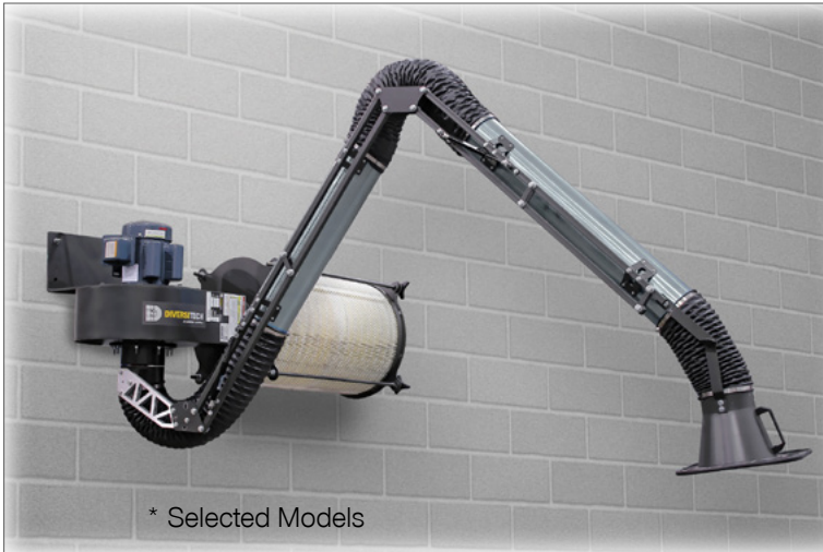
* Selected Models