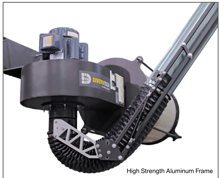
High Strength Aluminum Frame

The high-efficiency 26" filter collects submicron welding fumes before returning air to the facility. By capturing, cleaning, and recycling contaminated air, the FRED-ECO works as a heat recovery device, helping you keep energy costs down.