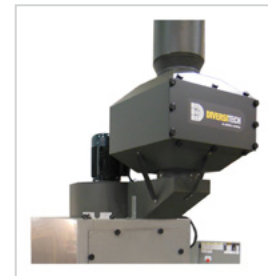
High-efficiency Hepa after-filter kit (MERV 17)