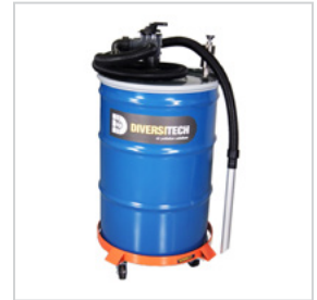
WV-55 Sludge Removal Vacuum