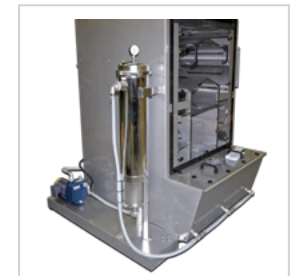
Self-cleaning strainer system to remove dust and sludge