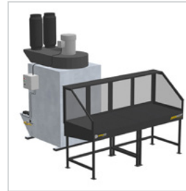
Ducted downdraft table in four standard sizes