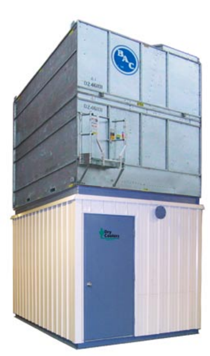
Aqua-Evap™ OMR Series are designed to match the footprint of the cooling tower for a compact and attractive housing for mechanical cooling equipment.