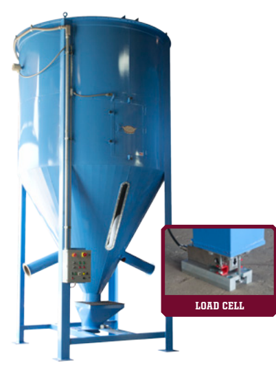
Eagle Load Ring<sup>™</sup>

Eagle Magnum Mixers are fast, economical batch mixers capable of mixing 10,000 to 100,000 pound batches. A large intake hopper accepts 1,000 pounds of material at one time. The internal vertical mixing auger rapidly draws the material into its tube and effortlessly disperses the material at the top of the mixer. The simplicity of the mixing concept explains the years of dependable service experienced with every rapid mix model. Shipped assembled with controls for easy installation.