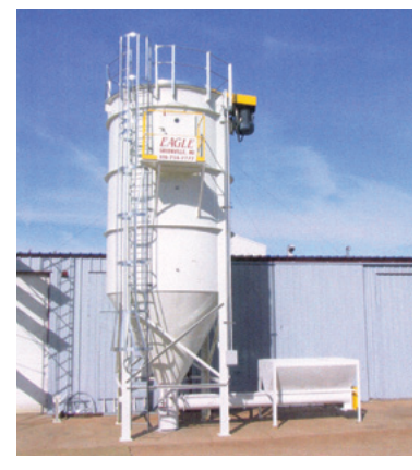
Silo Blenders with side mounted drive motors.