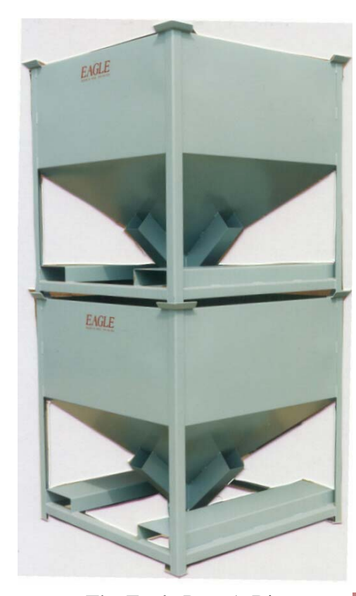
The Eagle Port-A-Bin

Because the hoppers are portable, your production operations become more efficient. Hoppers can be equipped with casters for another mobile dimension.