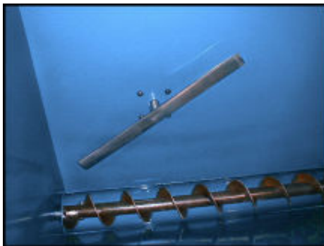
Top view of hopper showing open auger and an optional agitator designed for fluff.

All Ensign Equipment Inc. products carry a TWO YEAR warranty covering defects in manufacture, workmanship and components. Also all STANDARD products are covered by the Ensign Advantage, a 30 day trial period guaranteeing customer satisfaction!