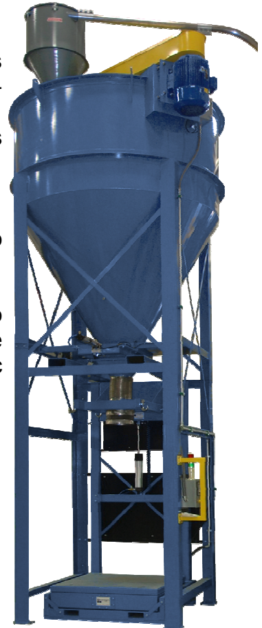
Mixer shown with vacuum loader and integrated bulk bag filling system

See back page for additional options and specifications.